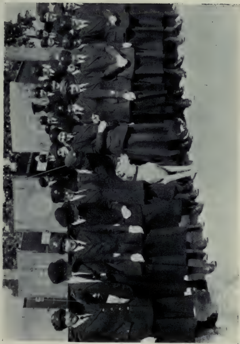
A V.A.D. Motor Convoy.